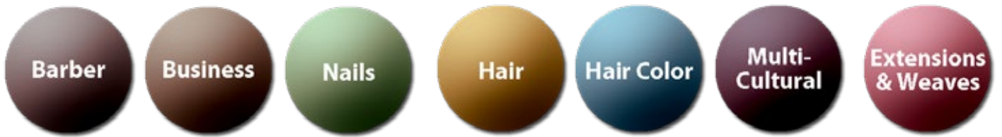
IMAGE Expo offers one of the most comprehensive and diverse educational programs in the beauty industry.